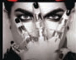
FOR YOUR ENTERTAINMENT ADAM LAMBERT

Howdy disco citizens! It's time for your weekly dose of Groovelines – your source for what's hot and hip in the land of electronic dance music and beyond.