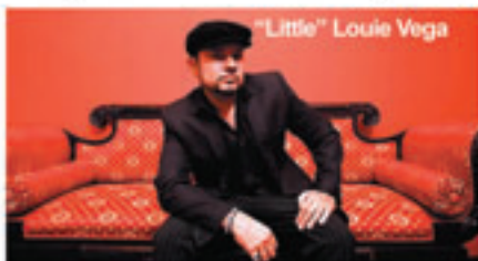
"Little" Louie Vega

house heads will totally drool over. Talkin' about Strictly Social Diva and the Lost Tapes: "Little"