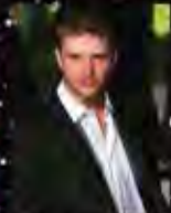
Virgo Famous Birthdays

Beyoncé Knowles, Raquel Welch, Gloria Gaynor, Pink, Adam Sandler, Ryan Phillippe