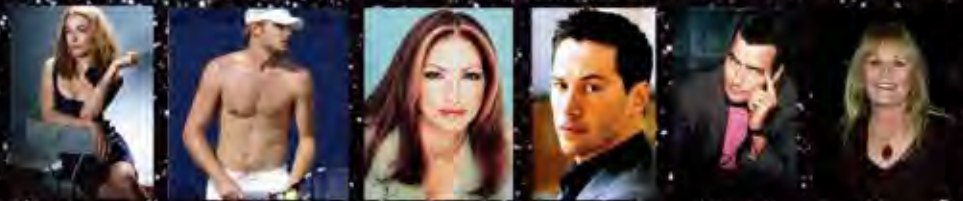
Virgo Famous Birthdays

LeAnn Rimes, Andy Roddick, Gloria Estefan, Keanu Reeves, Charlie Sheen, Valerie Perrine