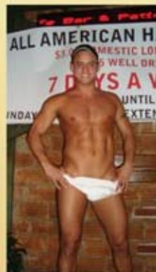
Houston South Beach, JR's and more...