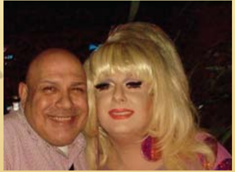
Austin Lady Bunny Ollcan Harry's