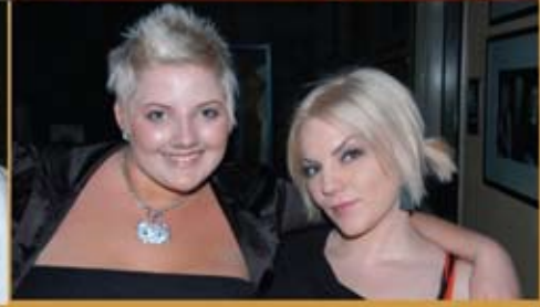
Dallas Tin Room, Woody's Sue Ellen's and more...